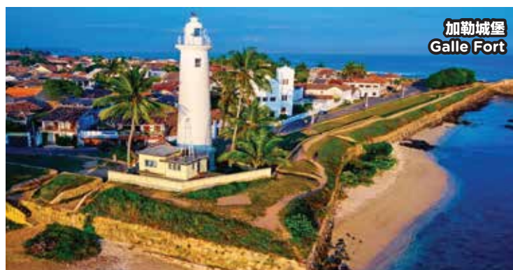
加勒城堡 Galle Fort