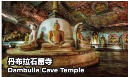
丹布拉石窟寺 Dambulla Cave Temple